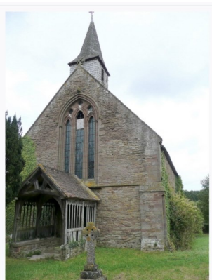
St John the Baptist's church