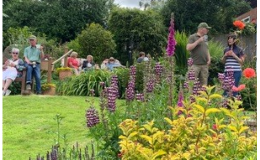
Little Birch Open Gardens in June p2